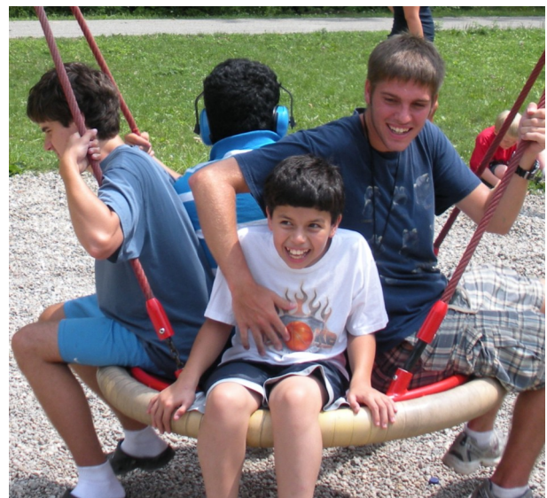
Bruce Awad Summer Program field trip to the park. August 3, 2010

We'd also like to extend our gratitude to the staff at the Green Shield Windsor office who held a 50/50 draw on our behalf on August 20th. A total of $600 was raised.